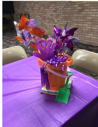
Top and Left: Centerpiece and Sand Pail Decorations